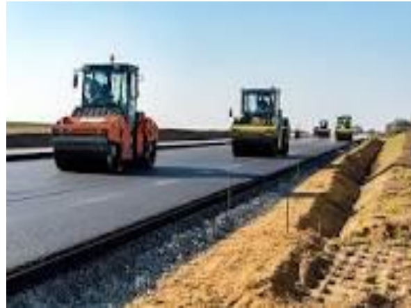
Figure 1: Components of a road maintenance

An inventive pavement technique called self-healing asphalt seeks to solve the problem of degradation over time. Because of its self-repairing nature, road surfaces last longer and require less repairs over time. The potential of this technology to increase the resilience and sustainability of road infrastructure has drawn attention. Because a self-healing asphalt is porous, water can pass through it without building up and causing harm (Liang et al., 2021). Steel wool is used in the development of self-healing asphalt. To increase the strength of the pavement, small particles of steel wool are added into the asphalt mixture and inducted heating is used to let the steel wool to penetrate into micro-cracks (Yang et al., 2023).